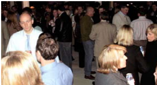
The Dothan Area Young Professionals recently held an official kick-off party at the park at the Highlands South subdivision.

"Quite simply, our target audience is individuals between the ages of 21-41 that carry themselves in a